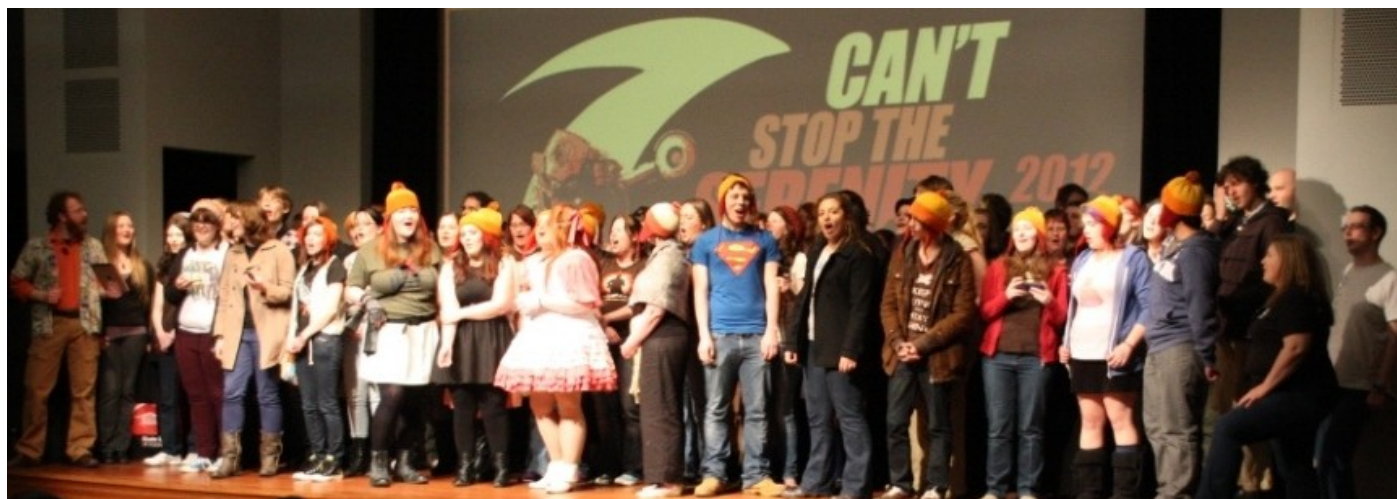
Singing "Hero of Canton" at Can't Stop the Serenity 2012 to beat the Browncoat World Record

http://www.youtube.com/user/newmelbbrowncoats