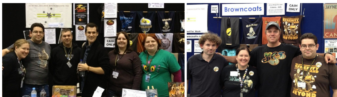
Sean Maher and Adam Baldwin at the New Melbourne Browncoats Charity Booth