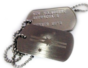
NMB Member Dog Tags